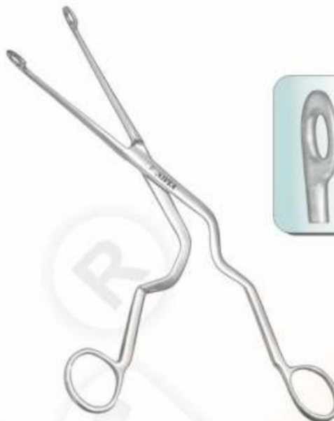
MAGILL INTRODUCING FORCEPS NB-221 INFANT 6" NB-222 CHILD 8" NB-223 ADULT 10"