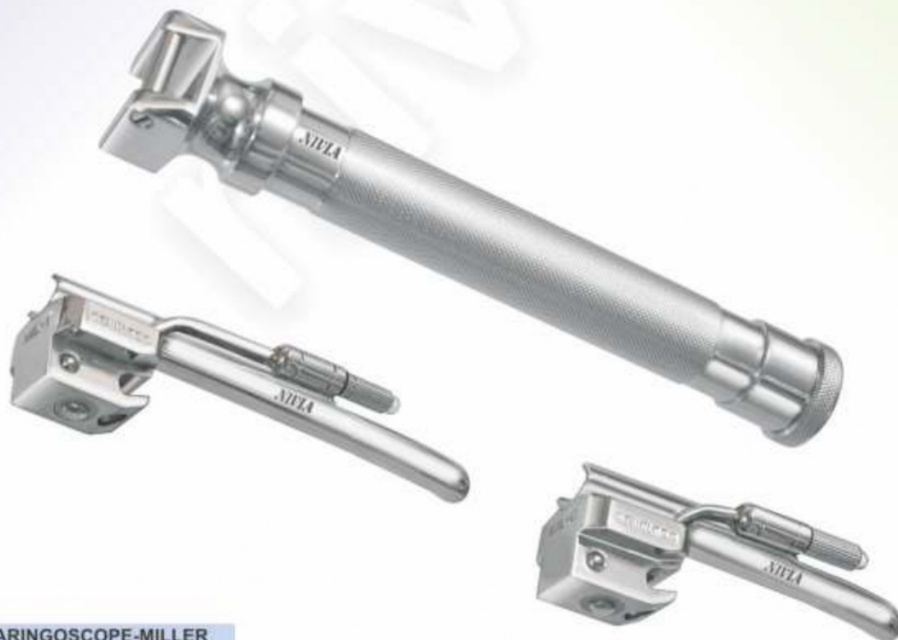
LARINGOSCOPE-MILLER PEAD. WITH TWO BLADES