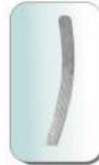
INTESTINAL CLAMP BABY KOCHER STRAIGHT CURVED NB-170 5" NB-171 5"