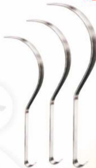
RETRACTOR MINI LAP DEAVER