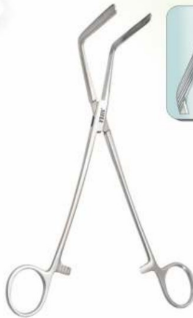
HYSTERECTOMY CLAMP WERTHEIM-CULLEN