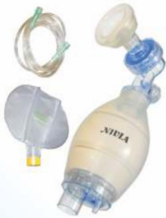
INFANT AMBU BAG SILICONE