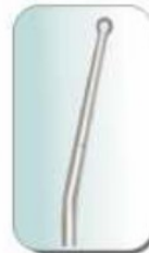
DIALATORS VASSEL N-289 7"