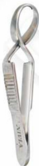
TOWEL CLIP CROSS ACTION ANGLED ENGL. MOD. NB-224 3 3/8"