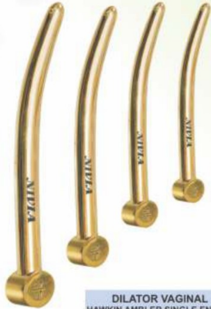
DILATOR VAGINAL HAWKIN AMBLER SINGLE ENDED NB-262-18 18cm/7" DIA 6 mm 11 mm 7 mm 12 mm 8 mm 13 mm 9 mm 14 mm 10 mm 15 mm