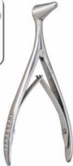
RECTAL SPECULA KILLIAN (FOR CHILDREN)