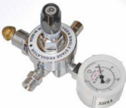
MOX REGULATOR OXYGEN SINGLE GAUGE NB - 313