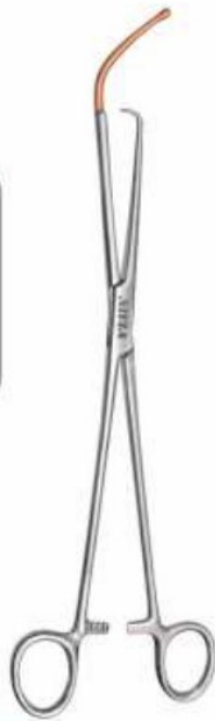
UTERINE ELEVATOR TEALE-KAHN NB-275 11"