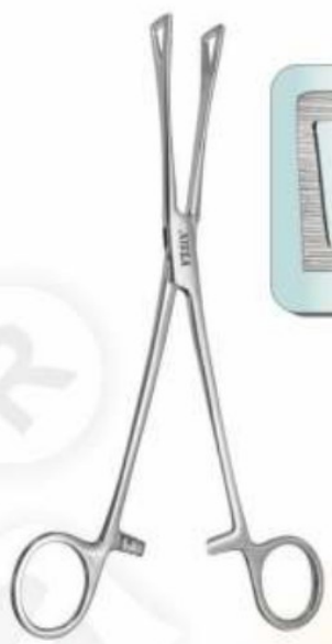
ORGAN HOLDING FORCEPS DUVAL NB-096 7" OPTIONAL 8"