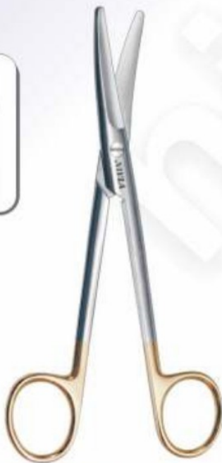
SCISSORS MAYO TUNGSTEN CARBIDE