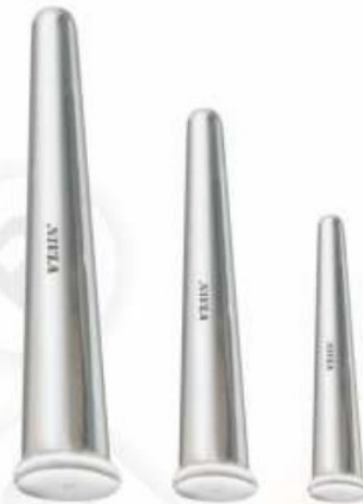
RECTAL DILATOR ST. MARKS