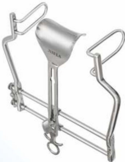
SELF RETAINING RETRACTOR BALFOUR STANDARD NB-163 8" SHAFT NB-164 10" SHAFT