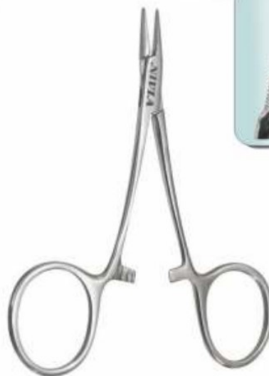
NEEDLE HOLDER CRILE WOOD NB-038 4" NB-039 6" NB-040 8"