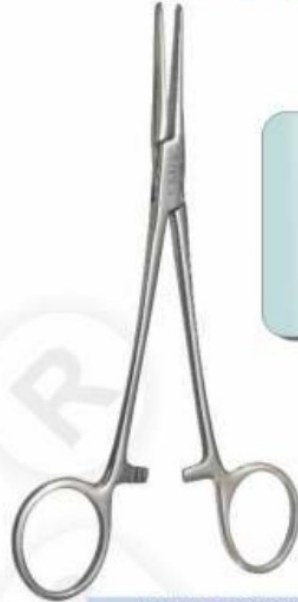
ARTERY FORCEPS SPANCER WELLS STRAIGHT CURVED NB-007 6" NB-010 6" NB-008 7" NB-011 7" NB-009 8" NB-012 8"