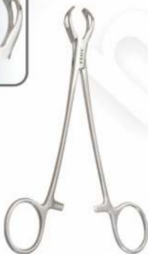
GLAND HOLDING FORCEPS LANE NB-037 6" NB-037 7" NB-037 8"