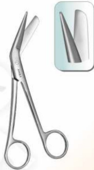
SCISSORS EPISIOTOMY BRAUN-STADLER NB-090 5 1/4"