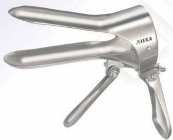
VAGINAL SPECULA CUSCO STANDARD NB-231 SMALL NB-232 MEDIUM NB-233 LARGE