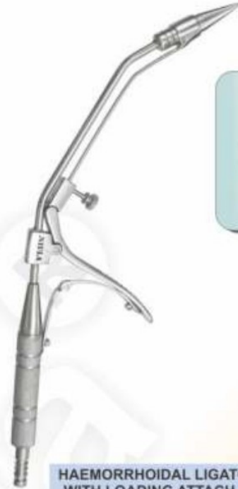
HAEMORRHOIDAL LIGATOR WITH LOADING ATTACH. & SUCTION PORT