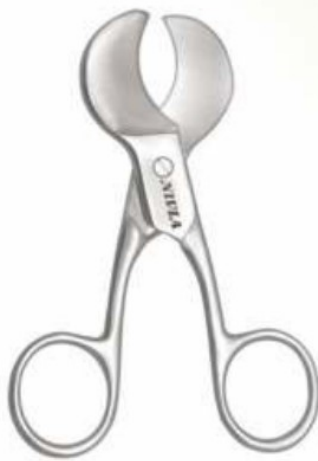
SCISSORS UMBILICAL MOD. USA NB-088 4¼"