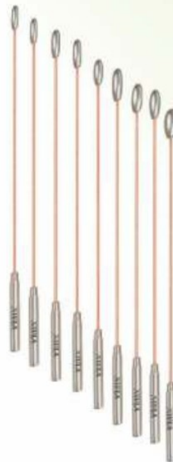
DILATOR BAKES MOD. MALLEABLE (COMMON BILE DUCT DILATOR)