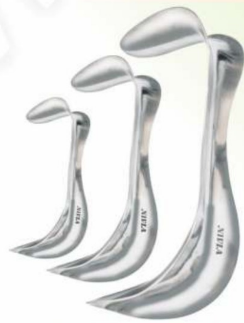
VAGINAL SPECULA SIMS STANDARD NB-234 SMALL NB-235 MEDIUM NB-236 LARGE NB-237 EXTRA LARGE