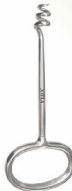
RING TYPE HANDLE DOYEN MYOMA SCREW NB-282 7"