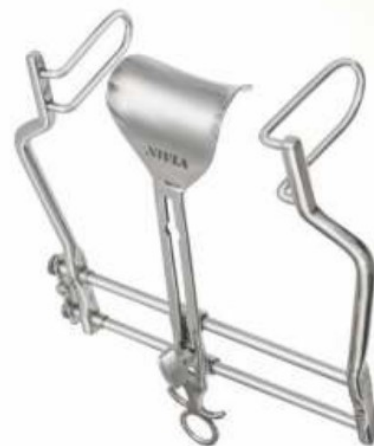
SELF RETAINING RETRACTOR BALFOUR BABY NB-162 10" SHAFT