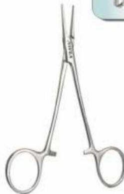
MOSQUITO HALSTED FORCEPS STRAIGHT CURVED NB-015 5" NB-016 5"