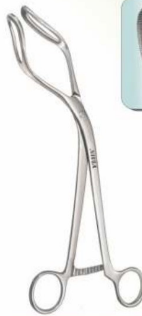
KIDNEY ELEVATING FORCEPS SOMER NB-190 10"