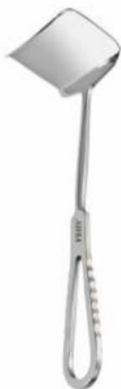
RETRACTOR MORISS WITH RING HANDLE (8 1/2")