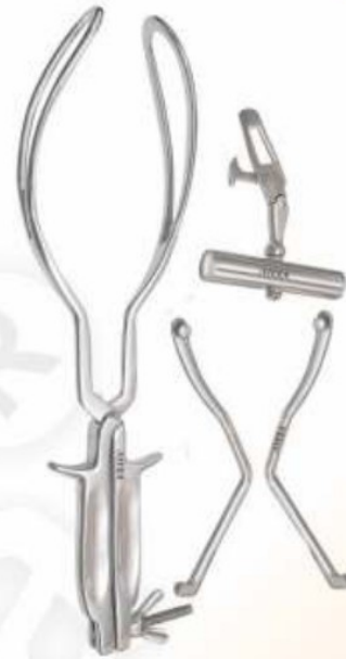
OBSTETRICS-OBSTETRICAL FORCEPS KEDARNATH DAS