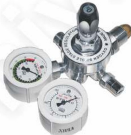
MOX REGULATOR OXYGEN DOUBLE GAUGE NB - 314