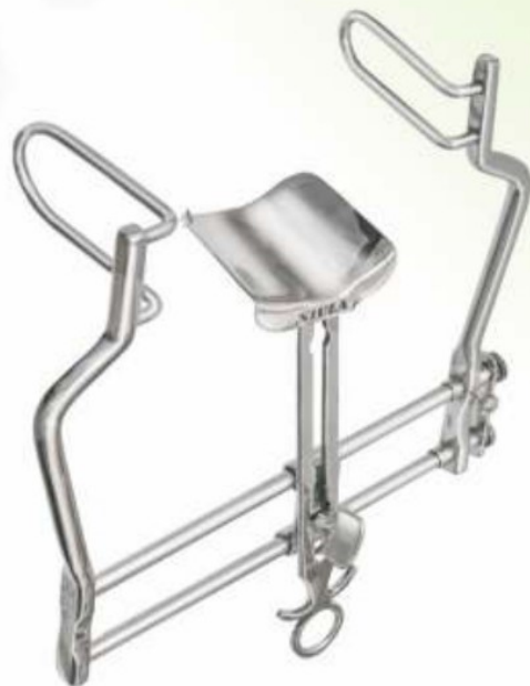
SELF RETAINING RETRACTOR BALFOUR MOD. (DEEP LATERAL BLADE) NB - 168 10" SHAFT