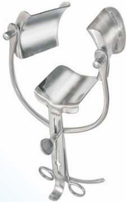
SELF RETAINING RETRACTOR POZZI'S NB-169