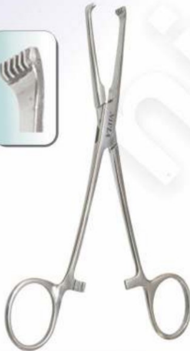
VULSELLUM FORCEPS TEALE NB-277 10"