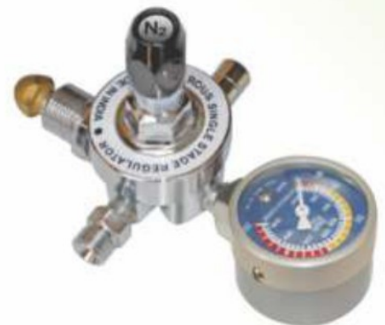
MOX REGULATOR NITROUS SINGLE GAUGE NB - 315