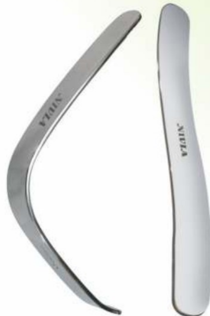
TONGUE DEPRESSOR BUCHWALD LACK'S STRAIGHT CURVED NB-004 5" NB-005 5"