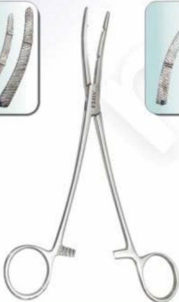
HYSTERECTOMY CLAMP HEANEY MOD. SINGLE, DOUBLE HOOK STRAIGHT CURVED NB-248 8" NB-249 8"