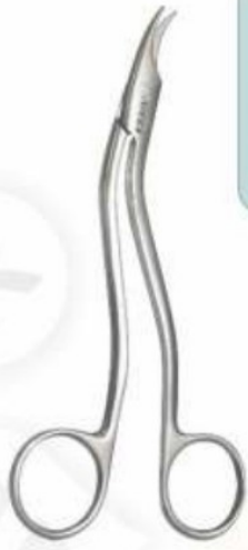
SCISSORS STITCH CUTTING NB-085 6"