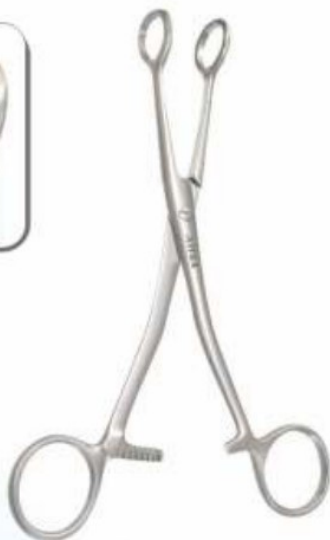
COLLIN FORCEPS NB-220 6 3/4"