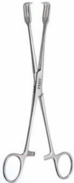
UTERINE TENACULUM FORCEPS SCHRODER NB-279 10 3/4"