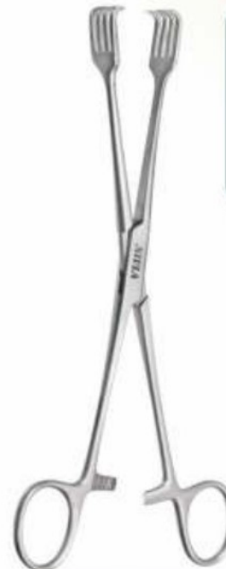
UTERINE TENACULUM FORCEP CZERNY NB-278 8"