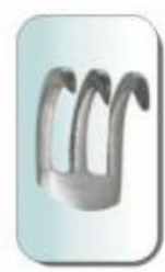
RETRACTOR SKIN THREE HOOK VICKERS NB-107 7"