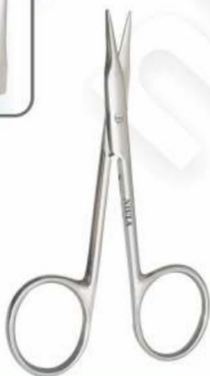
SCISSORS REYNOLDS CURVED NB-086 5" NB-087 6"