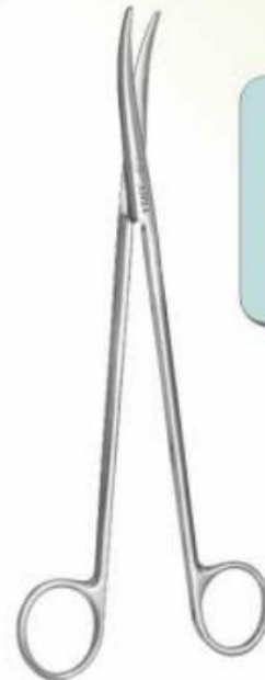
SCISSORS METZENBAUM FINE STRAIGHT CURVED NB-066 6" NB-068 6" NB-067 8" NB-069 8"