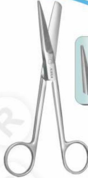
SCISSORS FINE SHARP & BLUNT STRAIGHT CURVED NB-054 6" NB-056 6" NB-055 8" NB-057 8"