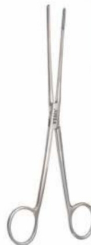
SINUS FORCEPS LISTER NB-286 6" NB-287 8"