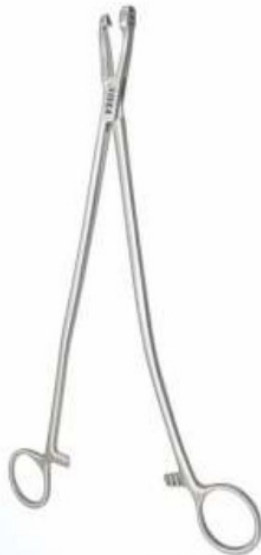
CERVICAL BIOPSY FORCEPS VAN - DOREN NB-283 10"