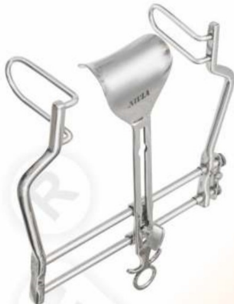
SELF RETAINING RETRACTOR BALFOUR MOD. N-165 10" SHAFT