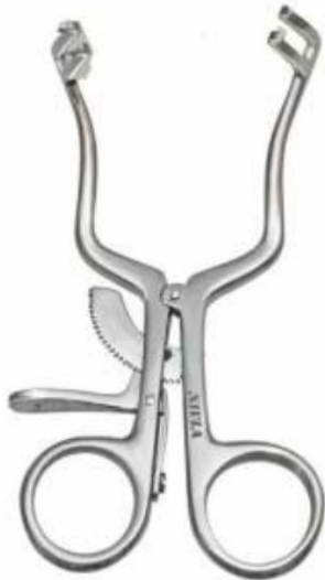
SELF RETAINING RETRACTOR PLESTER 2X2 NB-157 5" SHARP NB-158 5" BLUNT