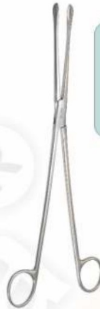
OVUM FORCEPS HEYWOOD SMITH 10" NB-284 No. 0,00,1,2,3,4