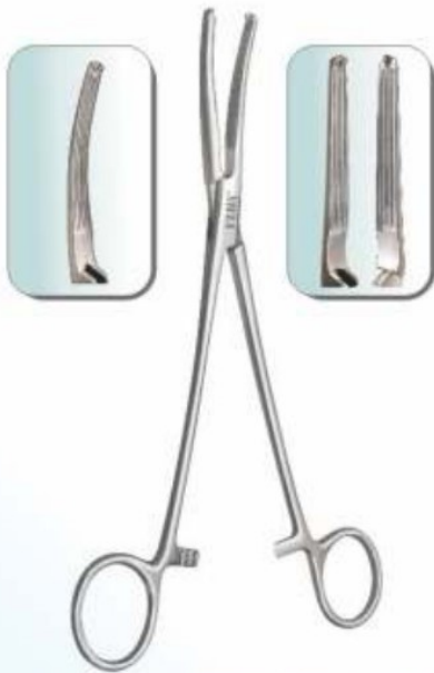
HYSTERECTOMY CLAMP GWILLIAMS STRAIGHT, CURVED NB-288 8"