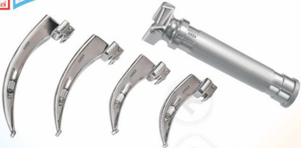
LARINGOSCOPE-MACINTOSH ADULT WITH FOUR BLADES