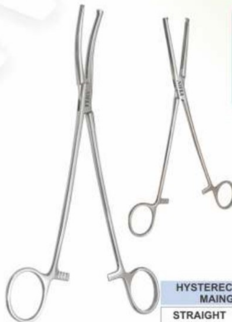
HYSTERECTOMY CLAMP MAINGOT MOD. STRAIGHT CURVED NB-250 8" NB-253 8" NB-251 10" NB-254 10" NB-252 12" NB-255 12"