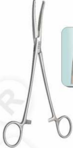
HYSTERECTOMY CLAMP HEANEY ATRAUMA NB-257 9"ST. NB-258 8"CUR. NB-259 8"EXTRA CUR. NB-260 8"ANGLED