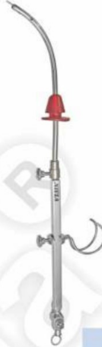
CURRIE CANULA NB-272 13"