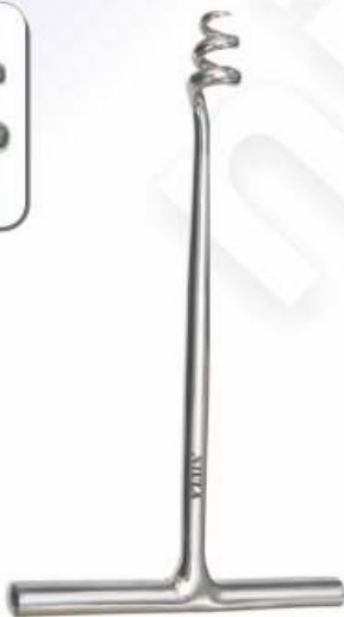
T TYPE HANDLE DOYEN MYOMA SCREW NB-281 7"