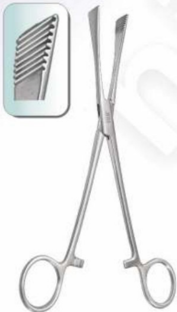
GREEN ARMYTAGE FORCEPS NB-290 8 3/4"