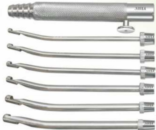
MTP CANNULA SET OF 6 NB-270 10 1/4"