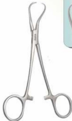
TOWEL FORCEPS BACKHAUS NB-225 4" NB-226 5" NB-227 6" NB-228 7"