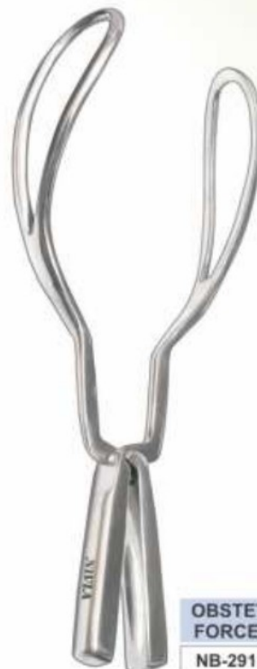
OBSTETRICS-OBSTETRICAL FORCEPS SIMPSON BRAUN NB-291 14"