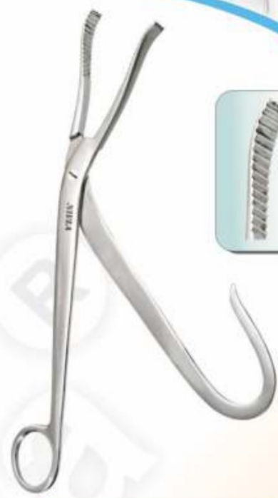
CHEATAL LH PATTERN FORCEPS NB-230 11"