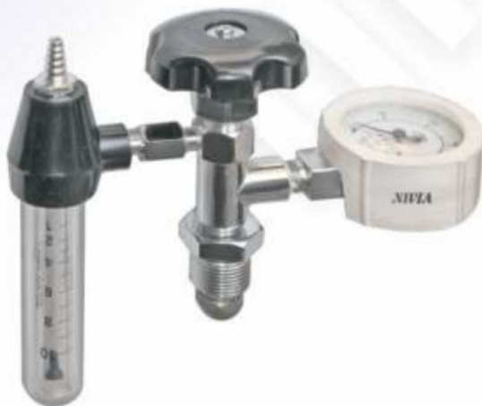
F.A. VALVE WITH FLOW METER NB - 308