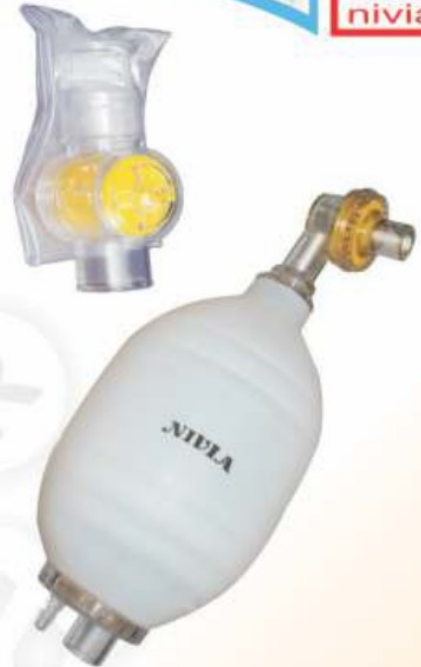
ADULT AMBU BAG SILICONE