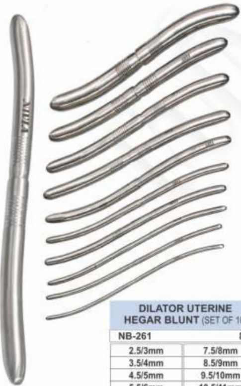
DILATOR UTERINE HEGAR BLUNT (SET OF 10) NB-261 8" 2.5/3mm 7.5/8mm 3.5/4mm 8.5/9mm 4.5/5mm 9.5/10mm 5.5/6mm 10.5/11mm 6.5/7mm 11.5/12mm