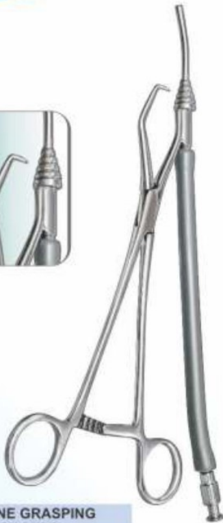
UTERINE GRASPING FORCEPS N-263