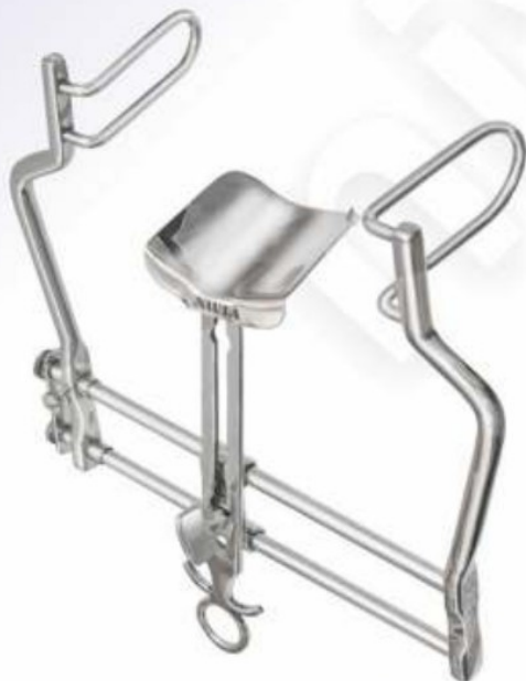
SELF RETAINING RETRACTOR BALFOUR STANDARD NB-166 8" SHAFT NB-167 10" SHAFT