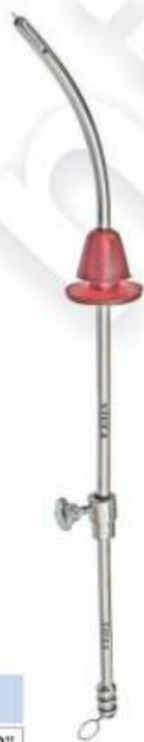
RUBIN CANULA NB-273 10"