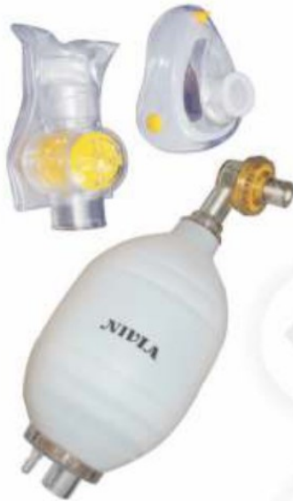
CHILD AMBU BAG SILICONE