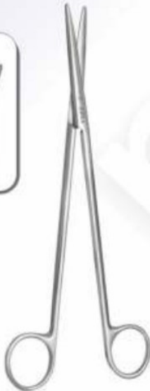
SCISSORS METZENBAUM STRAIGHT CURVED NB-058 4" NB-062 4" NB-059 6" NB-063 6" NB-060 8" NB-064 8" NB-061 9" NB-065 9"