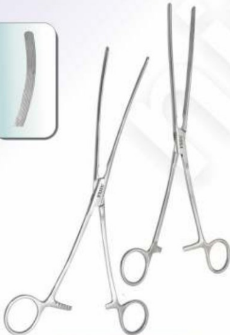
INTESTINAL CLAMP DOYEN STRAIGHT CURVED NB-172 10" NB-173 10"