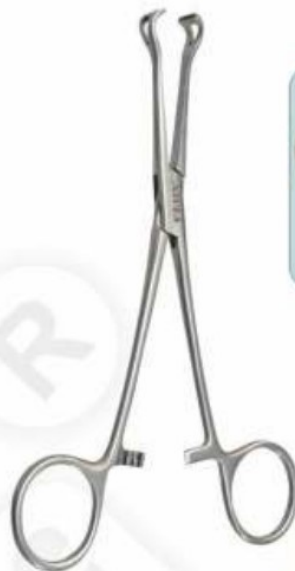
BABCOCK FORCEPS NB-035 6" NB-036 8"