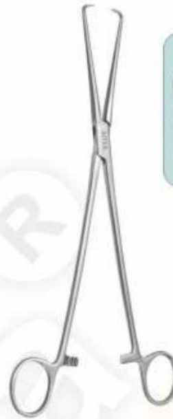
UTERINE TENACULUM FORCEP BRAUN (SLENDER TYPE) NB-276 10"