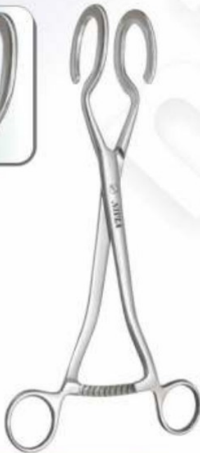
KIDNEY ELEVATING FORCEPS DARTIGUES NB-189 10"