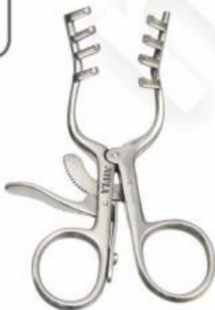
SELF RETAINING RETRACTOR MOLLISON 4X4 NB-161 6" SHARP