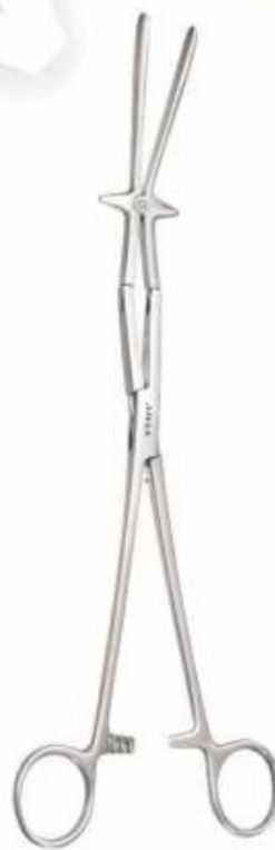
UTERINE ELEVATOR MANIPULATOR MOD. (DOUBLE ACTION) NB-274 11"