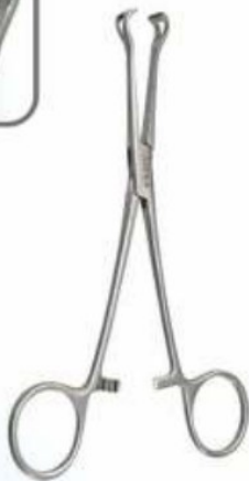
BABCOCK FORCEPS BABY NB-034 5"