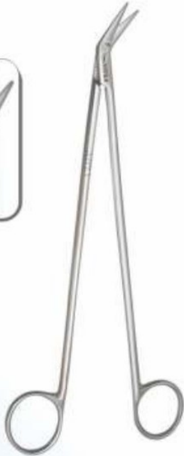
SCISSORS POTTS-DE MARTELL GALL DUCT