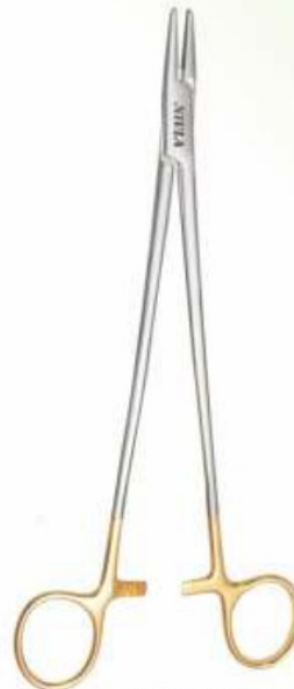
NEEDLE HOLDER MAYO HEGAR TUNGSTEN CARBIDE