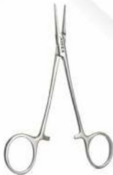
MOSQUITO BABY FORCEPS HARTMANN STRAIGHT CURVED NB-013 4" NB-014 4"