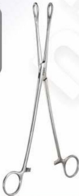
SPONGE HOLDING FORCEPS STRAIGHT FOERSTER NB-285 10"