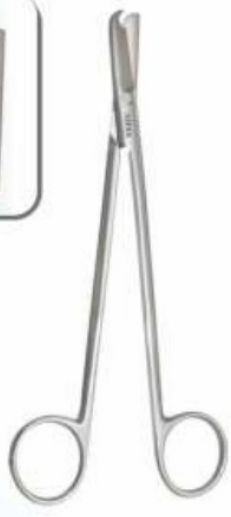
SCISSORS LIGATURE SPENCER NB-084 5½"