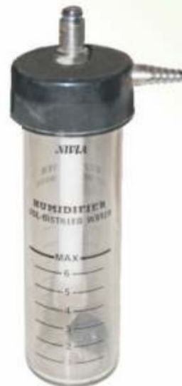
HUMIDIFIER BOTTLE POLYCARBONATE NB - 309