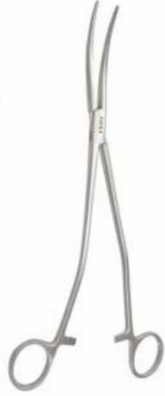
HYSTERECTOMY CLAMP NIVIA SPECIAL CURVED NB-256 10"