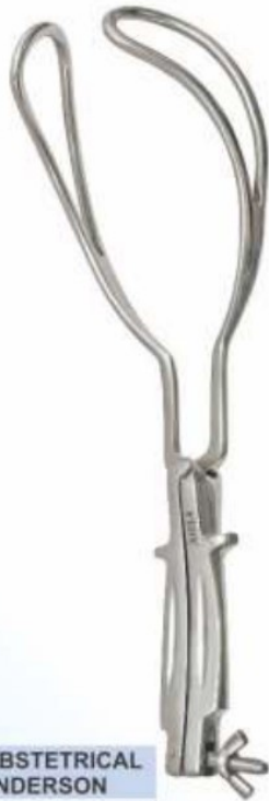
OBSTETRICS-OBSTETRICAL FORCEPS ANDERSON