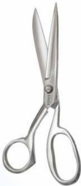
SCISSORS BANDAGE CUTTING NB-089 7"