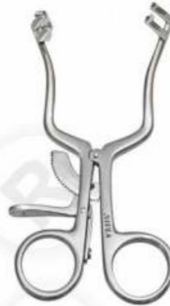
SELF RETAINING RETRACTOR WEITLANER 2X3 NB-159 4 1/4" SHARP NB-160 4 1/4" BLUNT