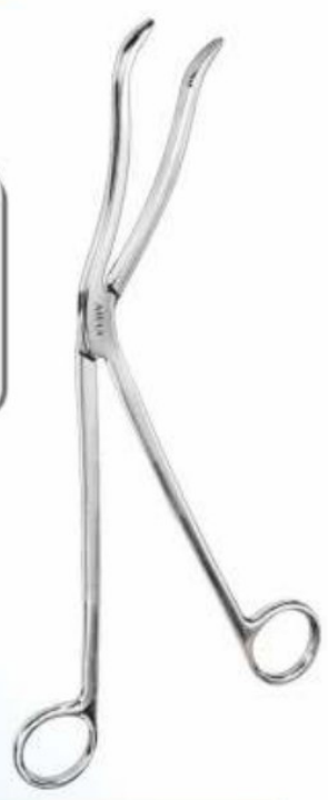
CHEATAL FORCEPS NB-229 10½"